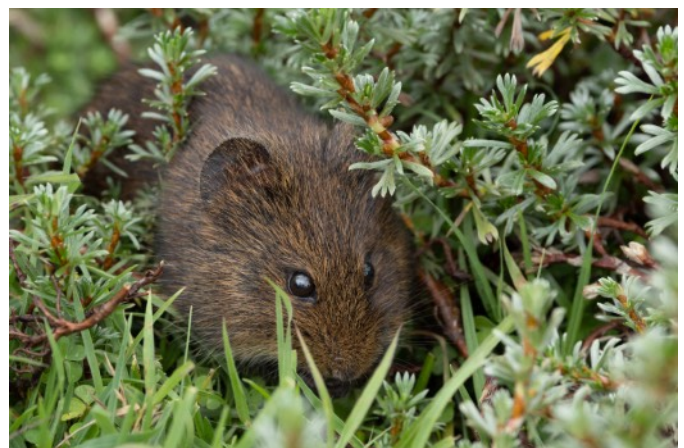
Above left: Four-striped Grass Mouse; Above Right: Afroalpine Vlei Rat