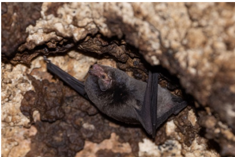
Above: Larger Bentwing Bat (clade 5)