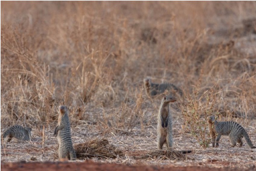
Above: Banded Mongooses