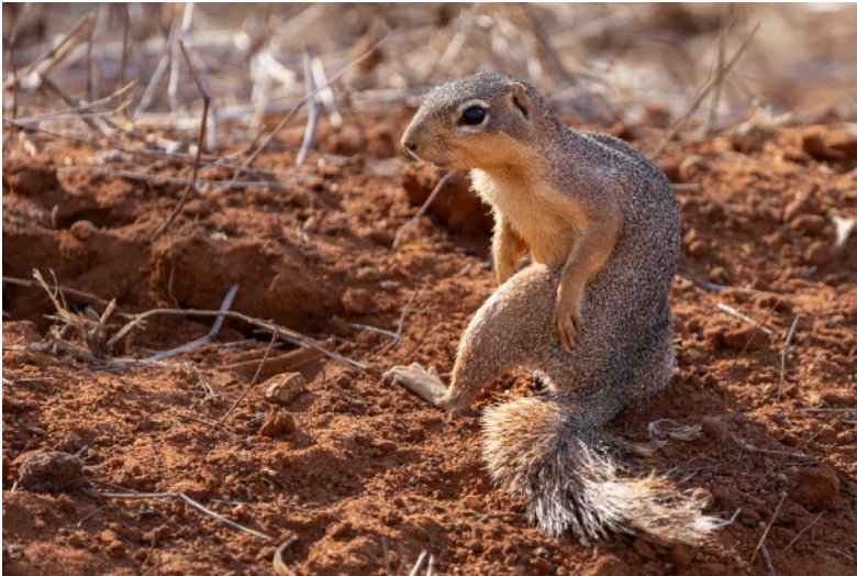
Above: Unstriped Squirrel