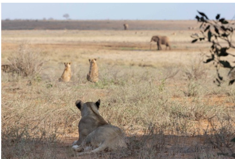
Above: Lions watching game in the valley below