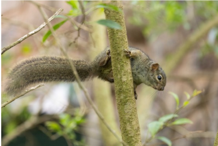
Above: Ochre Bush Squirrel

A 6.30 start for some birding on the property proved productive with several hirundines, as well as Cordon-bleu and Purple Grenadier. Ochre Bush Squirrels were common along the