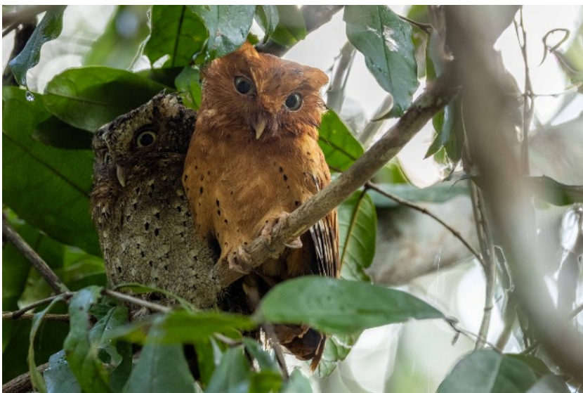
Left: Sokoke Scops Owls

Vulture, as well as another Zanj Sun Squirrel. We continued through the park, the vegetation evolving from Brachystegia woodland, to mixed forest, and eventually Cynometra forest, set on red, clay-rich soil featuring Brachylaena huillensis trees although sadly many had been cleared. Our luck continued with a fine flock of Crested Guineafowl and a fleeting glimpse of the near-endemic Mombasa Woodpecker. Our next find was perhaps one of the highlights of our visit here - a pair of Sokoke Scops Owls, nestled on a branch, looking straight down at us! Everyone enjoyed superb views of them before we continued. Towards the end of our morning walk we managed to observe a mixed flock containing some of the local specialties, including Chestnut Fronted Helmet-shrike, Amani Sunbird and the call of an East Coast Akalaat. Amongst them were many mousebirds, flycatchers, bulbuls and a skulking African Cuckoo.