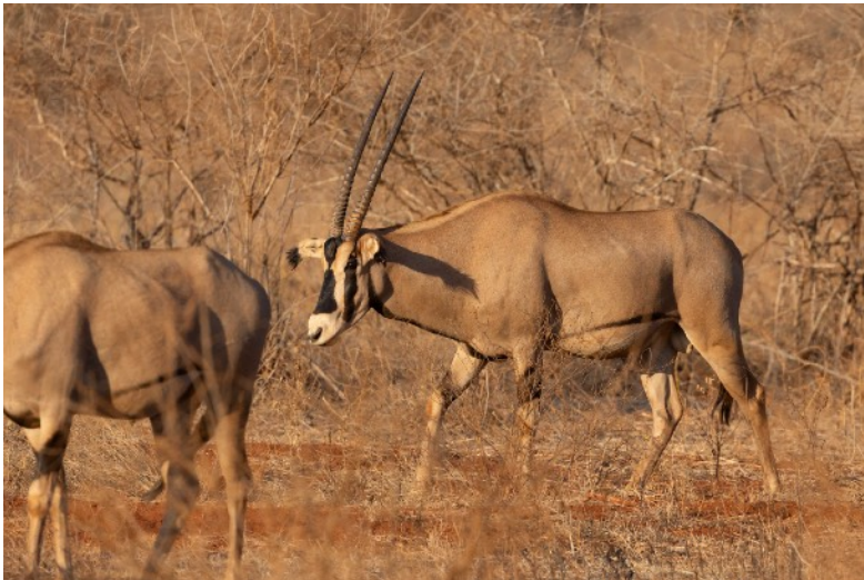
Below: Fringe-eared Oryx