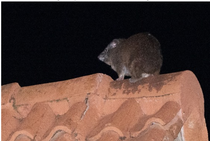
Below: Tree Hyrax, Aberdare Country

the Crested Rat but were unsuccessful. We did however find a Southern Tree Hyrax on the lounge roof along with the usual suspects in the field - Impala, Bushbuck, Mountain Suni. Nightfall brought the expected shrill of the Tree Hyraxes!