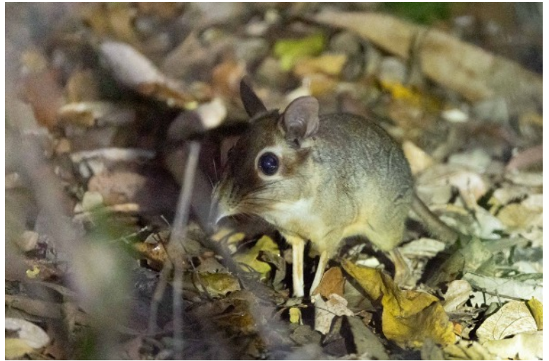
Above: Four-toed Elephant Shrew

Shem and Kaburo had requested a 5am start, so we were up at 4.30am and out soon after that. We explored the park by road this morning and it wasn't long after we entered that a Four-toed Elephant Shrew appeared on the road! Continuing to a waterhole in a small clearing we had our first encounter with an African Bush Elephant , a solitary bull that left the water tank and crossed our path. There were some new birds for us here including Black-headed Heron, Hadedda Ibis, Greater Sparrowhawk and Palm-nut