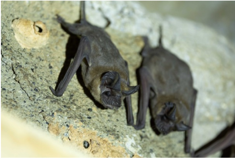
Above: Egyptian Free-tailed Bats