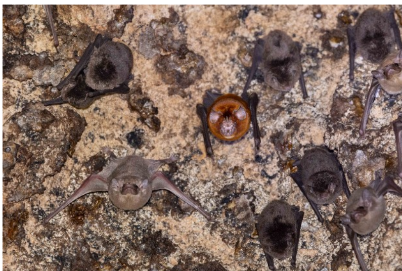
Above right: Striped Leaf-nosed Bats Right: African Trident Bat (golden morph) with smaller Bentwing and African Sheath-tailed Bats