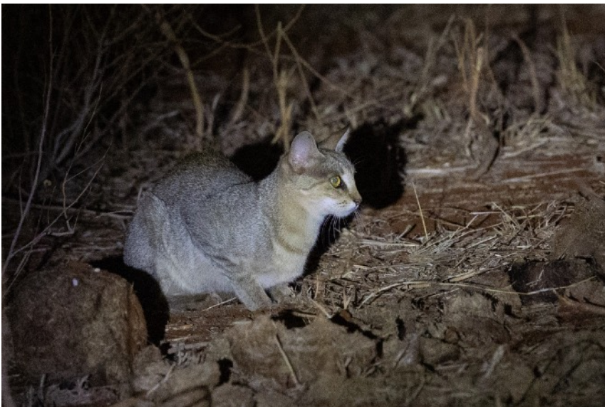
Below: African Wildcat

hillside and scanned the valley below them. It was a magical start to our time in Tsavo. Continuing towards Voi gate, we passed a mob of Banded Mongoose going about their business. There were large numbers of hornbills around Voi and we were further greeted by a large herd of Cape Buffalo as we arrived at Voi Lodge. At 7pm we departed on a night drive which lasted just over 2 hours and despite a slow start, proved to be incredibly productive. The thermal camera picked up Black-backed Jackals , two North African Wildcats , Coke's Hartebeest , zebra, elephant, giraffe, Scrub Hare , African Civet , White-tailed Mongoose , Emin's Gerbil , two unidentified mice and an unidentified rat. We returned to the lodge for a much needed dinner, satisfied with a total count of 23 mammals for the day!