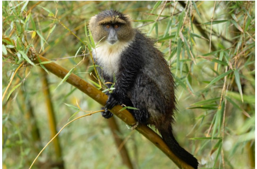
Above: Kolb's White-collared Monkey

Continuing through the high moorland, we passed a small group of Bohor Reedbuck , a fleeting duiker - likely Harvey's Duiker , and later a troop of Kolb's White-collared Monkeys - a highland subspecies of Sykes monkey. There were many Jackson's Spurfowl in this area, including some with young. The baboons were omnipresent and the birds kept appearing. Giant forest hogs were relatively common in the park and we passed groups on a few occasions, including with young, and some common warthog. Finally it was time to leave the park and check-in at the Aberdare Country Club. Set in beautiful grounds, there were a lot of animals to see here! Turning in the gate there were several impala visible as well as a small herd of zebra, and walking up to our rooms, a Mountain Suni ! By the dining area we found a Savanna (scrub) Hare . After dinner the group retired but I persevered a little longer and managed to find a Tree Hyrax by the dining area and also a White-tailed Mongoose. No success with the Crested Rat though. Near my room was an extremely confiding Savannah Hare that enabled very close views. I turned in but was soon awakened by the deafening night calls of Tree Hyraxes which it sounded like they were in my room!