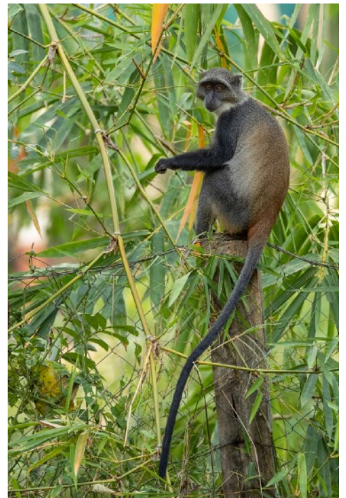
Right: Sykes Monkey, Arabuko Sokoke