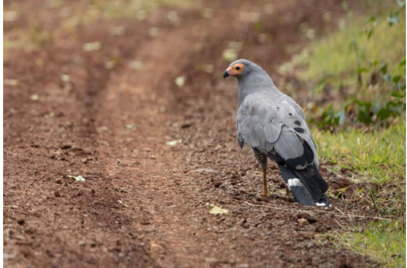
Above: A determined African Harrier-hawk

were present in the grounds. Our timing in Aberdares couldn't have been better as it coincided with some rains that had triggered swarming of termites, when winged reproductives (alates) emerge and take flight to start new colonies. This in turn triggers frenzied feeding by predators including birds, mongooses and rodents, and this created a lot of activity. The roads were littered with termite wings, and on turning a corner on one of the tracks we witnessed an African Harrier-hawk