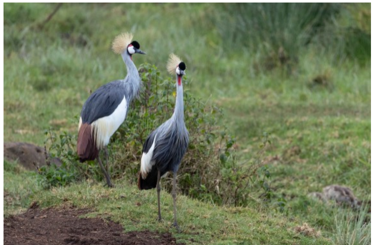
Right: Grey-crowned Cranes, The Ark

The waterhole was the highlight of the Ark and always had a wonderful atmosphere. Some pre-breakfast scanning here produced various waders and some small passerines. We checked out and started our morning drive in the park, which kicked off with a parrot (probably Orange-breasted) flying over - we hoped for closer views.