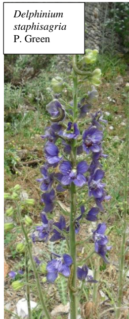
Delphinium staphisagria P. Green