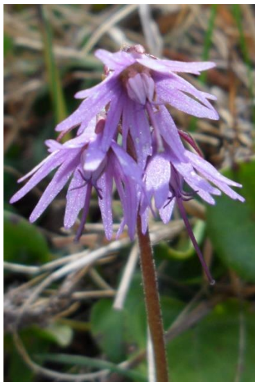
Soldanella pindicola – P. Green

We woke up to clear blue skies for our last day of looking at the wonderful wildlife of Northern Greece. Before we had chance to get into the vehicles a Sparrowhawk flew over the hotel.