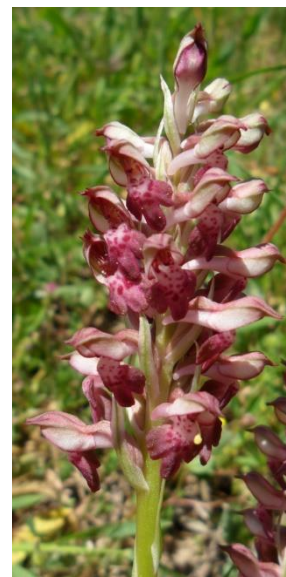
Bug Orchid – P. Green

It was a beautiful sunny day as we headed to Rodia Marsh for some bird watching. We parked on the roadside and immediately saw a Coypu out in the water happily munching away. It wasn't long before we saw Night Heron, Pygmy Cormorant, Glossy Ibis and two Marsh Harriers. There were a few pink heads of Butomus umbellatus (Flowering-rush) and Oenanthe fistulosa (Tubular Water-dropwort) amongst reeds. On the edge of the marsh Ruth found a few clumps of Althaea officinalis (Marsh-mallow) and a patch of Lycopus europaeus (Gypsywort). A dusty track was taken alongside the marsh where many weedy plants could be found on the verges including: Cerinth major (Greater Honeywort), Euphorbia platyphyllos (Broad-leaved Spurge), Silybum marianum (Milk Thistle) and Matricaria chamomilla (Scented Mayweed). In the centre of the track was the tiny sticky Spergularia bocconeii (Greek Sea-spurrey). Squacco Herons were in large numbers. A few Great Reed Warblers were seen and heard. A Peregrine Falcon few over. It was some way down the track before we started seeing Dalmatian Pelicans. Large areas of the water surface had turned red where it was smothered in Azolla filiculoides (Water Fern), a non-native species.