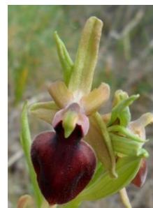
Ophrys helenae – P. Green

The day was finished at a view point over the border into Albania.