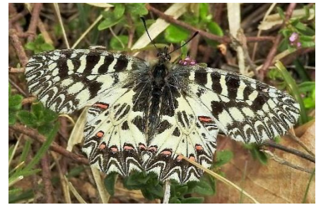
Eastern Festoon – P. Waterton

Our last stop of the day was on the roadside in search of orchids. David found one large Orchis italica (Italian Man Orchid) and it wasn't long before we came across Serapias bergonii . Todd found a small clump of Ophrys cornuta which he nicknamed the Horny Orchid. Lysimachia atropurpurea with blood red flowers was just coming in flower.