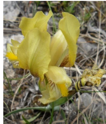
Iris reichenbachii – P. Green

The next stop was above an army training area which was fenced off. The group explored the slope above. Orchis morio (Green-winged Orchid) was common, and we had one specimen of Woodcock