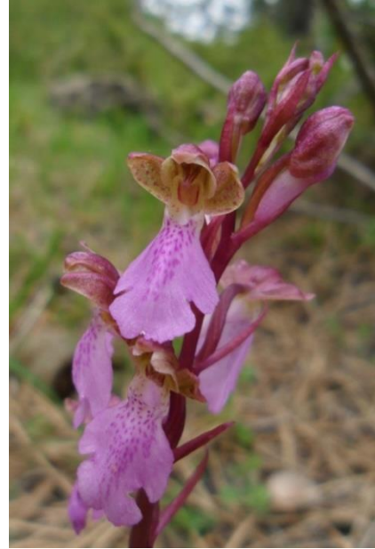
Orchis spitzelli

Our last stop of the day was into the pine and Abies borisii-regis woodland between Milia and Krania. We were surprised to see the loggers busy at work. Despite the disturbance to the area we still managed to find a number of Neotinea maculata (Dense-flowered Orchid) flowering, the last new species of orchid for the trip. Also under the trees was Erica herbacea .