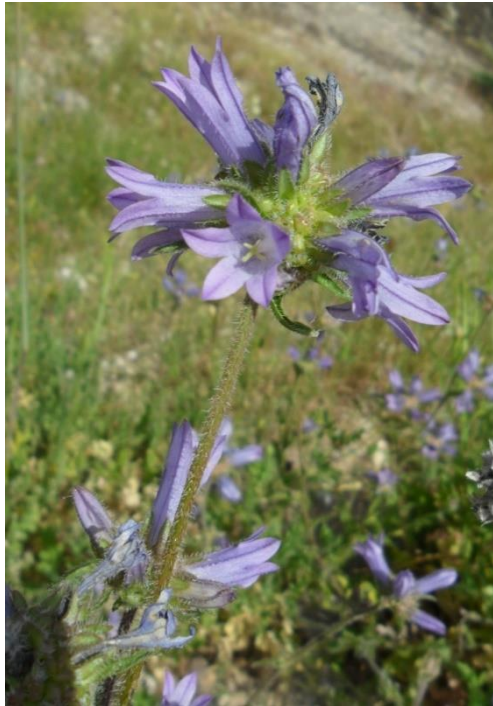
Campanula lingulata – P. Green

We started the day with a wander around Metsovo while Ian went to try and buy a petrol cap for his van. Under the plane trees included weeds such as Veronica polita (Grey Field-speedwell) and Anthriscus caucalis (Bur Chervil). On the walls around the village square clung Geranium pusillum (Small-flowered Crane's-bill) and Valerianella carinata (Keeled-fruited Cornsalad). Many Jackdaws were nesting in the holes in the Plane trees.