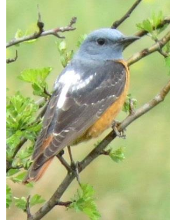
Rock Thrush – P. Keith

Another quick roadside stop was made to photograph wonderful displays of Caltha palustris (Marsh-marigold). Along the edge of a beech hanger was plenty of Symphytum bulbosum (Bulbous Comfrey) and on the grassy slope the Fritillaria montana was flowering. Cardamine bulbifera (Coralroot) put on a good display of pale pink flowers under the beech trees.