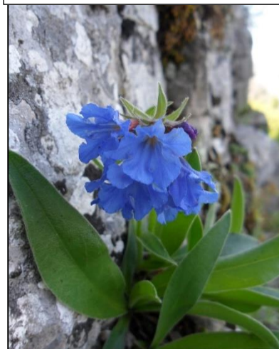
Lithospermum goulandrionum P. Green